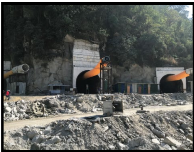
Arun III Hydroelectric Project