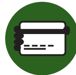
Banking and Finance

#investinnepal Partnership for Economic Transformation