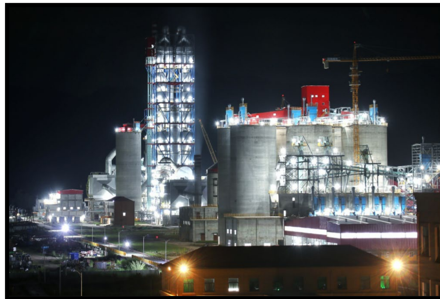
Hongshi-Shivam Cement Project