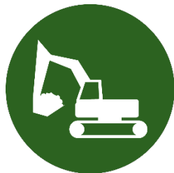
Mines and Minerals