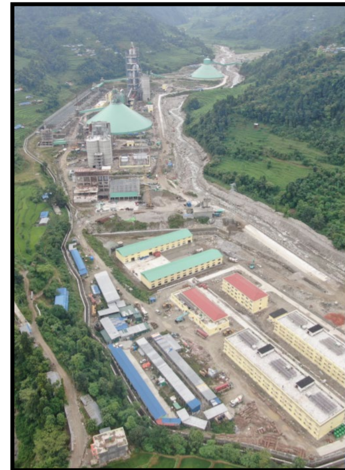
Huaxin Narayani Cement Project

#investinnepal Partnership for Economic Transformation