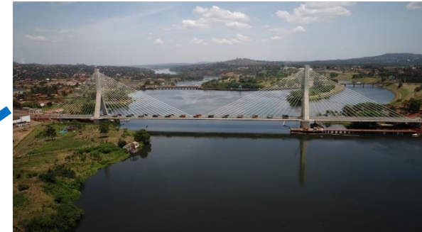
Development of Mombasa port and roads and bridges of the surrounding corridor: Connecting inland states to the Indian Ocean