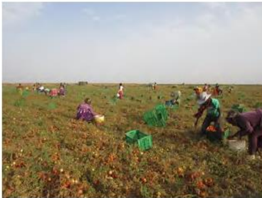
Harvesting tomatoes at the test cultivation field (Saint-Louis). Harvesting tomatoes into crates (harvesting baskets).