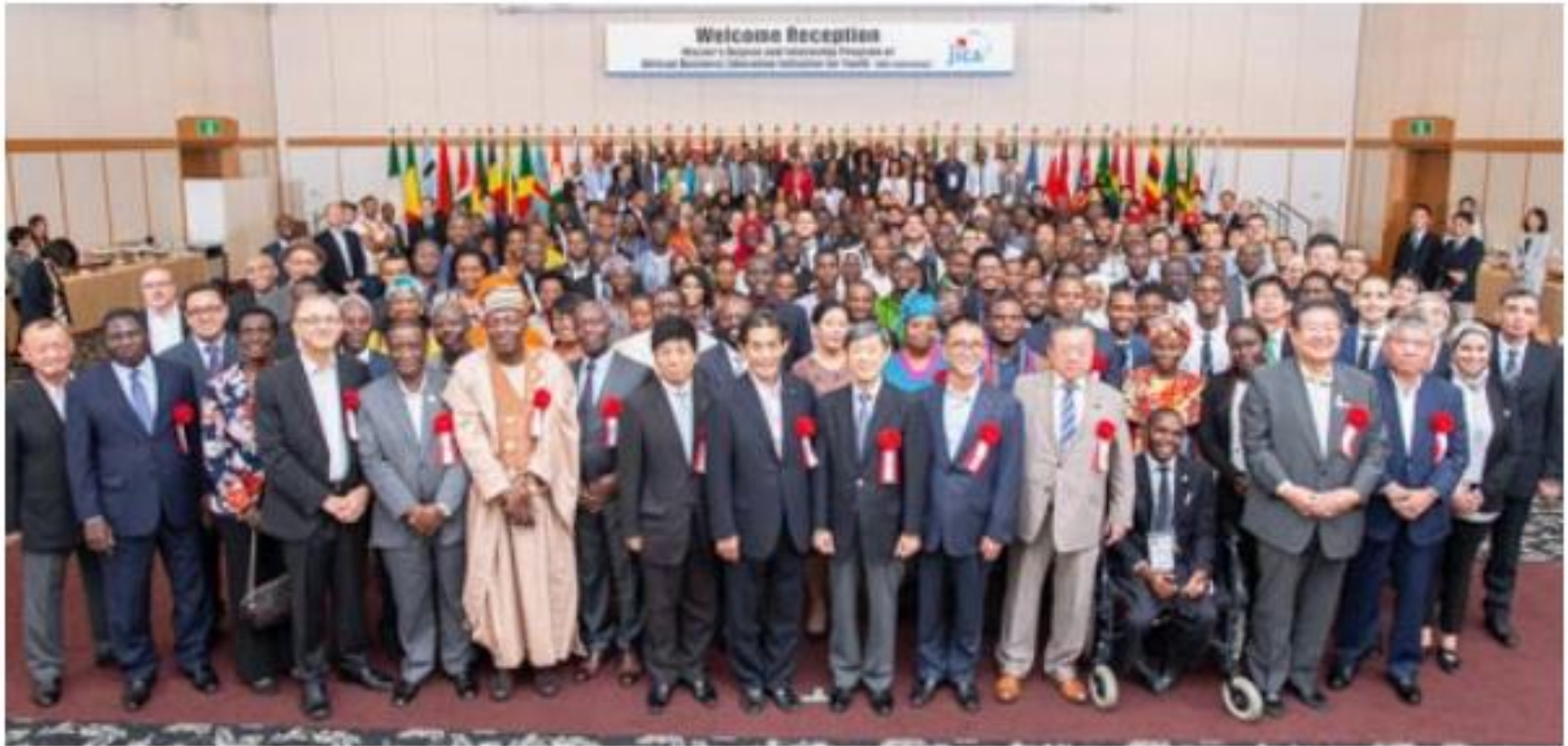
Group Photo at the welcome reception on September 5, 2018

ABE Initiative has welcomed over 1200 youth from Africa since 2014 to a scholarship program over 2 years in Japan for master degree and internship in Japanese companies, aiming at getting practical experience and contact with Japanese business community.