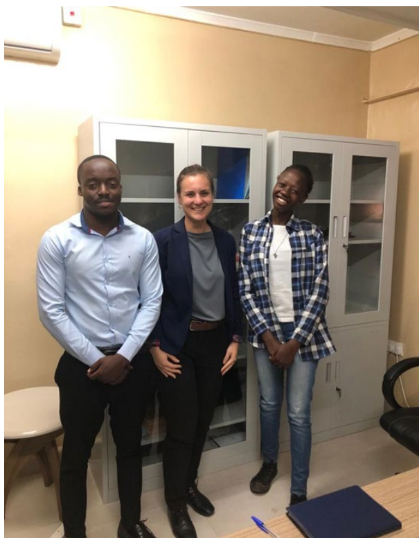
Knowledge sharing session with an M&E Specialist from UNIDO Morocco