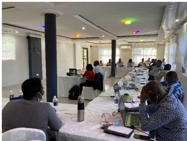
Photo during the TNA workshop