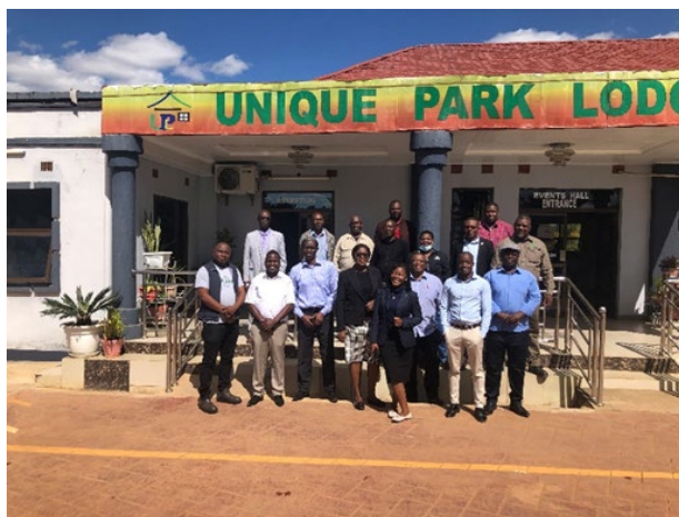
Group photo during TNA Workshop