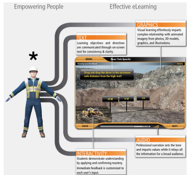
eLearning provides an effective way to empower operators.