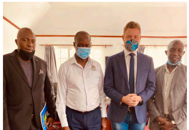
UNIDO PC met the Permanent Secretary and MoWT counterparts on 30 October