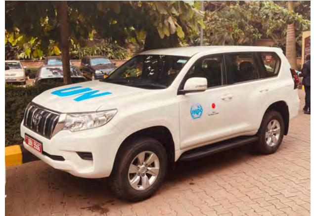
In line with the communications strategy, the project vehicle now features stickers "From the People of Japan"