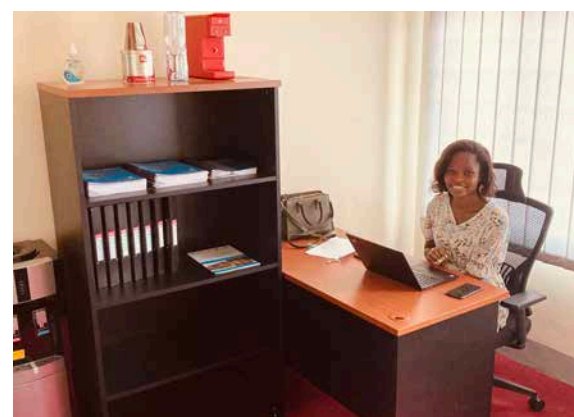
UNIDO moved into the project office on the MoWT premises