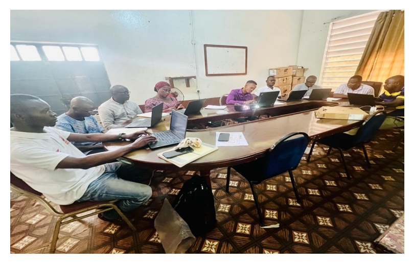
Ongoing IC3 training at Freetown Polytechnic