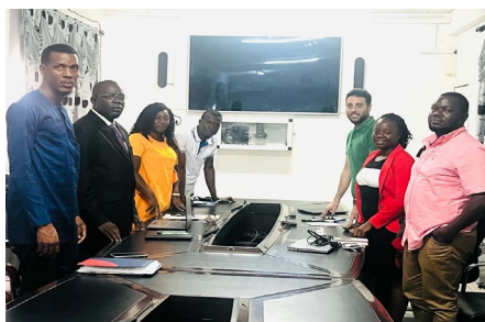
Meeting for Workplan Approval