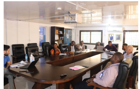
Meeting for Assessment Questionnaire Approval