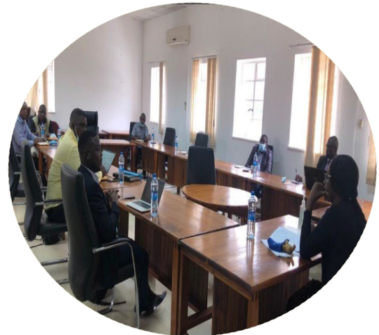
In photo KVTC/Project staff during a meeting with TEVETA