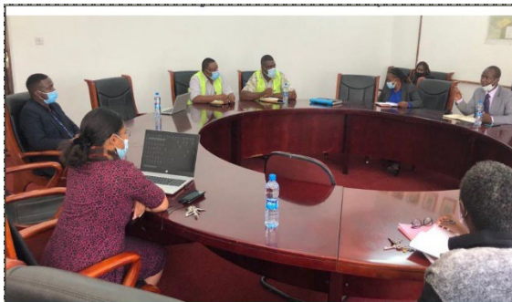
In photo KVTC/Project staff during a meeting with the PS MoTS