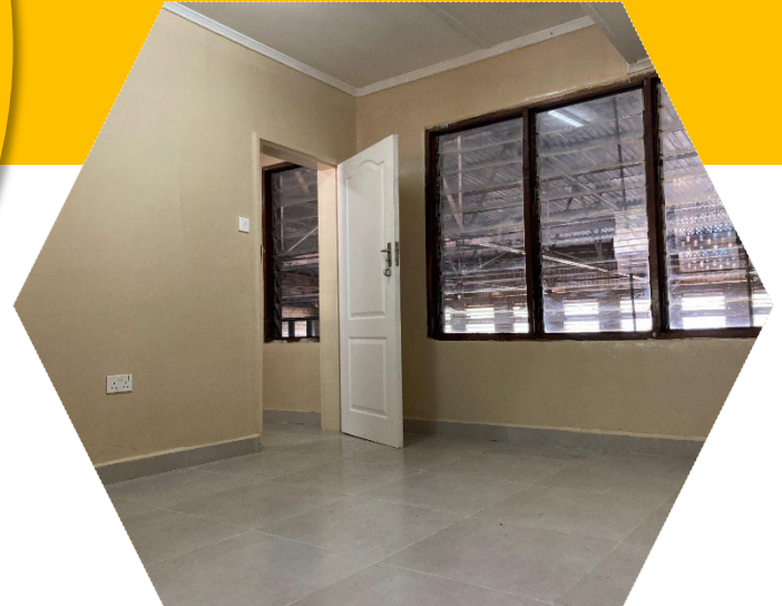
Office renovation at completion stage