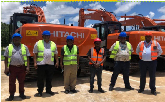
In photo KVTC/project staff during a tour of Hitachi