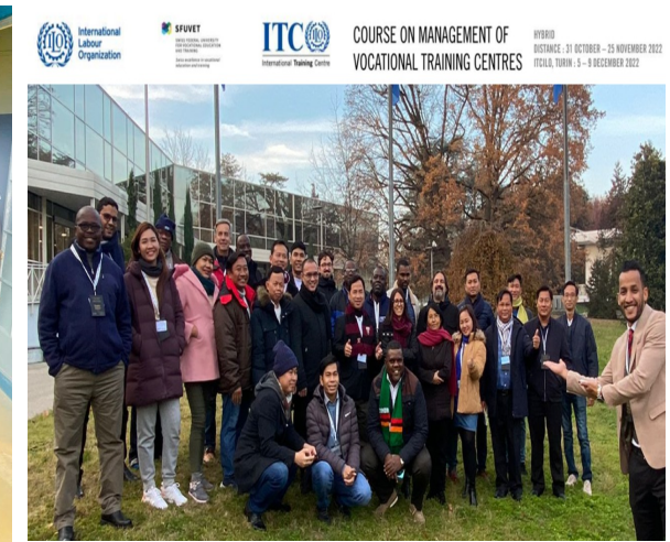
Vocational Training Management with ICTILO