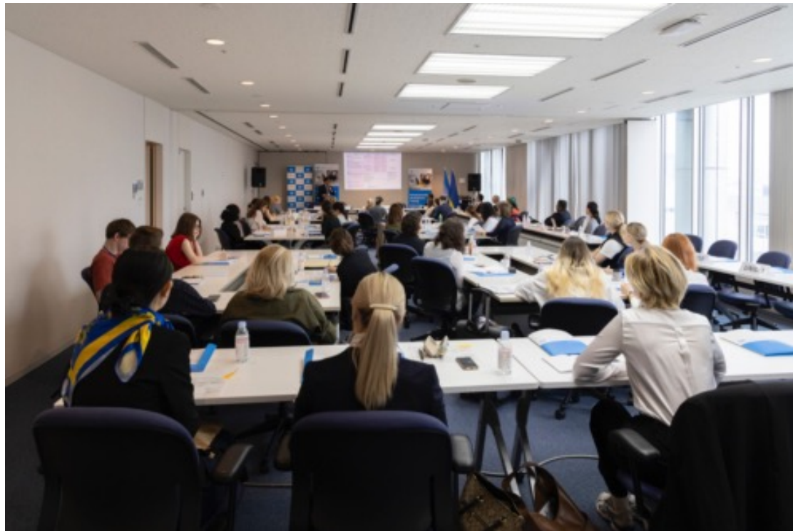
Programme Venue (Image only)