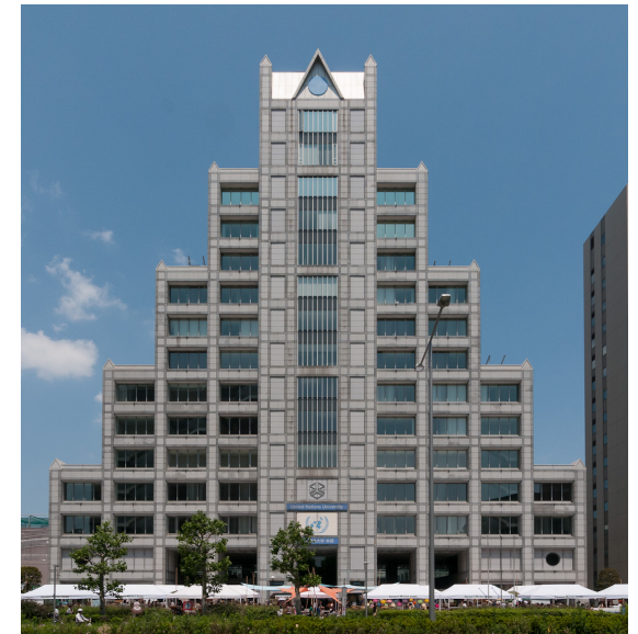
United Nations University, Tokyo, Japan