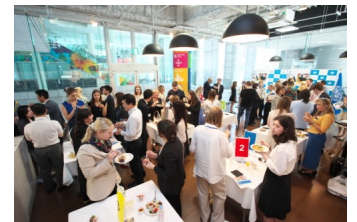
Networking with industry