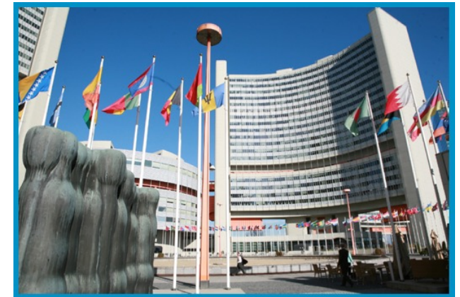
UNIDO Headquarters in Vienna, Austria

UNIDO ITPO Tokyo's official website: http://www.unido.or.jp