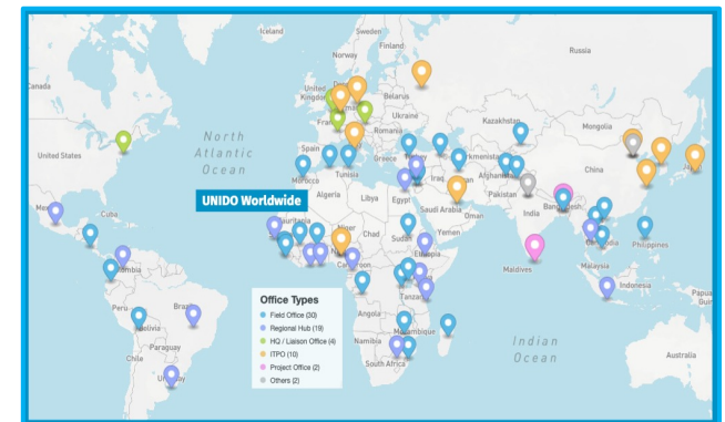
UNIDO has 48 offices around the world