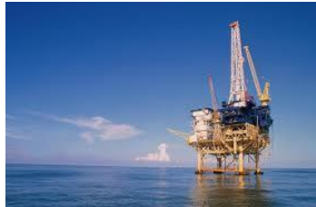
Mineral/Natural Resources: Oil & Gas