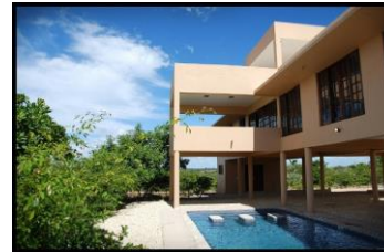
Tourism & Real Estate