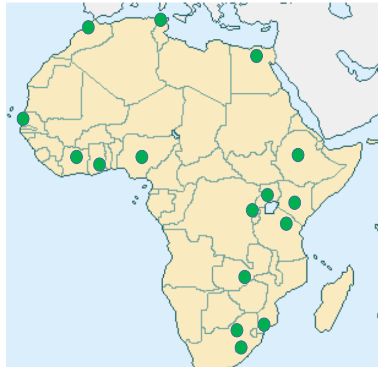
Delegates invited from Africa in 2013-2018

Officials in charge of investment promotion in developing and emerging countries are invited to Japan (average 2 weeks)