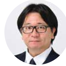
Professor Aoyama Business School