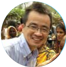
Director and CSO Impact Design Accounting Office, Inc.