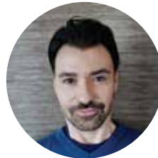
Co-Founder and CEO Mugen Links LLC