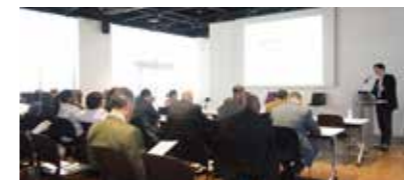
'Kaizen' Workshop for ADC in Tokyo (September 21, 2017)