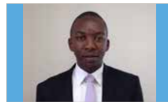
Zambia (2012, 2014)