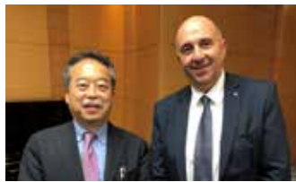
Morocco (2010, 2018)