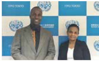
Mozambique (2012, '13, '15, '18)