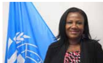
Cote d'Ivoire (2014)