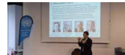
Industrial policy workshop for ADC in Tokyo (January 10-11, 2019)