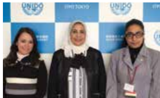
Egypt (2009, 2013, 2017)