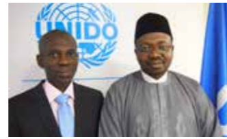
Nigeria (2009, 2010, 2017)