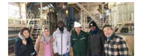
Site visit to Matsuo Neutralization Plant for acid mine drainage (January 18, 2019)