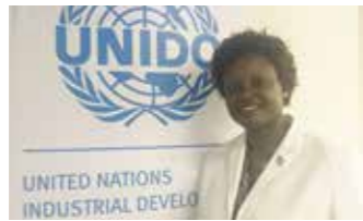
Uganda (2011, 2017, 2018)