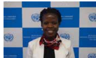
Kenya (2009, 2010, 2016)