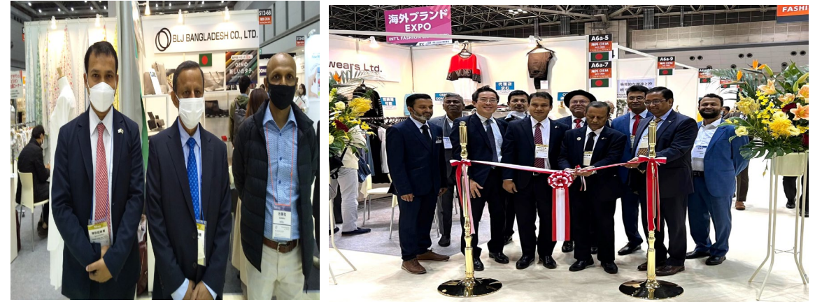
Fashion World Tokyo, Spring and Autumn 2022