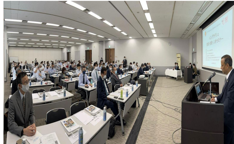
Trade, Investment & Human Resources Seminar, Saitama