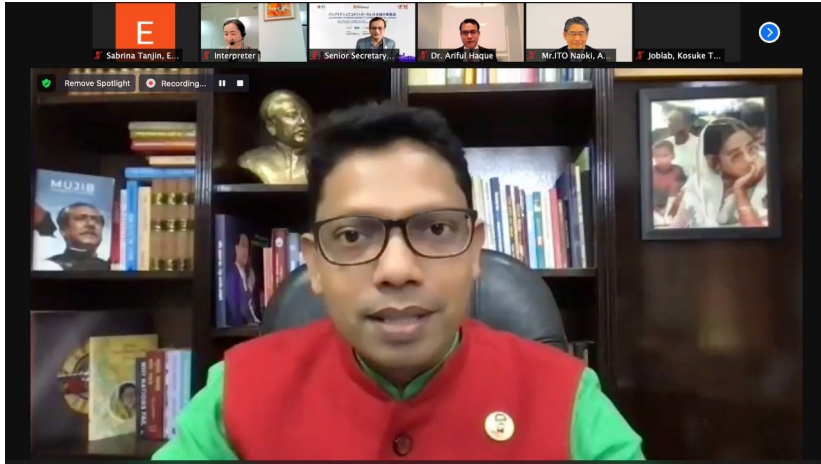
Bangladesh IT Connect Portal-Japan Launching https://jp.itconnect.gov.bd/