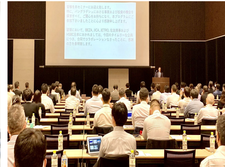
Investment Seminar, Tokyo