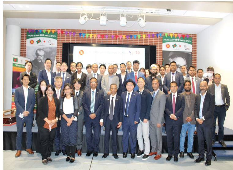
Bangladesh-Japan IT Networking Event at Embassy