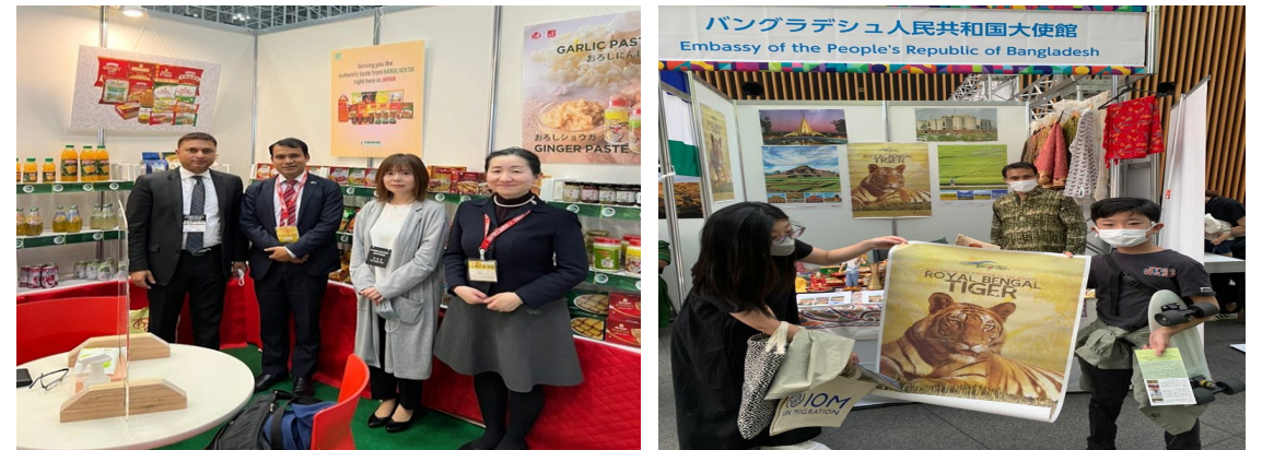
FOODEX Japan, 2022