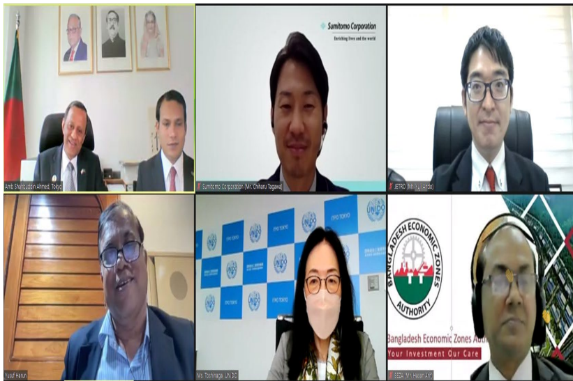
Webinar on Economic Zones in Bangladesh