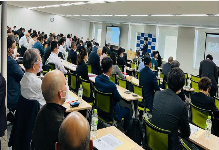
Human Resources Seminar, at JITCO, Tokyo