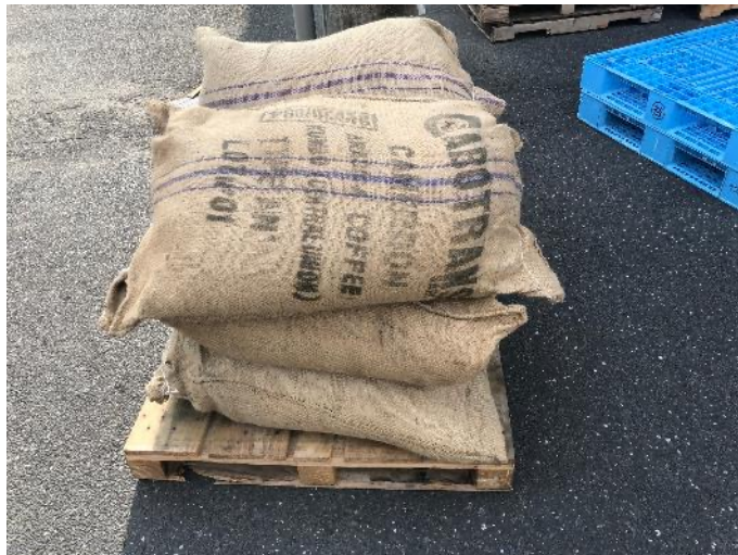
Cameroon coffee arriving in Oita