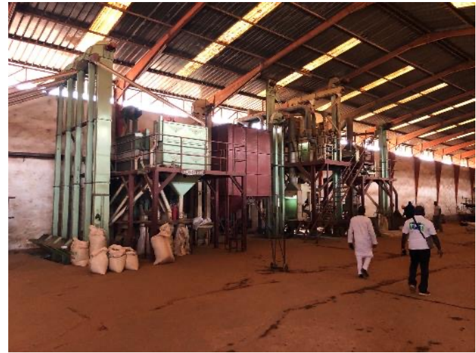
Green Bean Production Factory Inspection