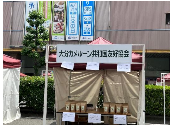
Also sold at events in Oita City