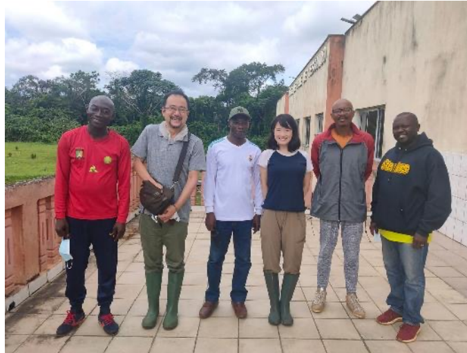
Interview with Mayor Massondo

~Small-scale hydroelectric power generation business~