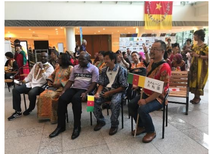
Participated in a festival in Oita