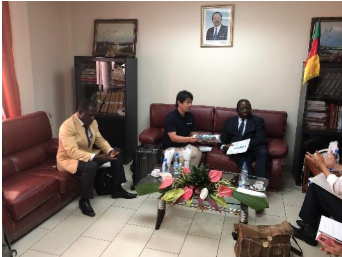
Field Survey (Interview with the Minister of Commerce)