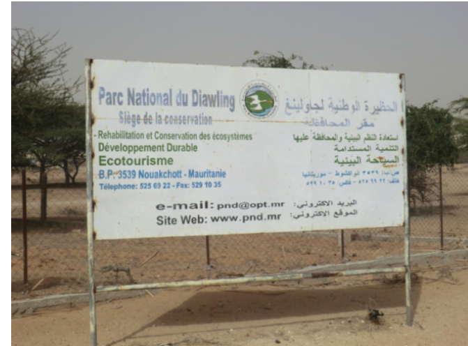
Signboard of Diawling National Park