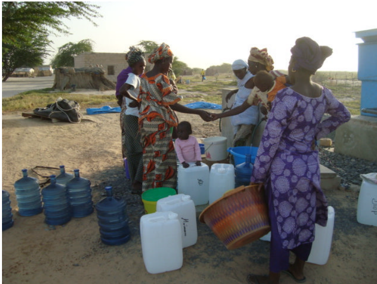
Village people buy water