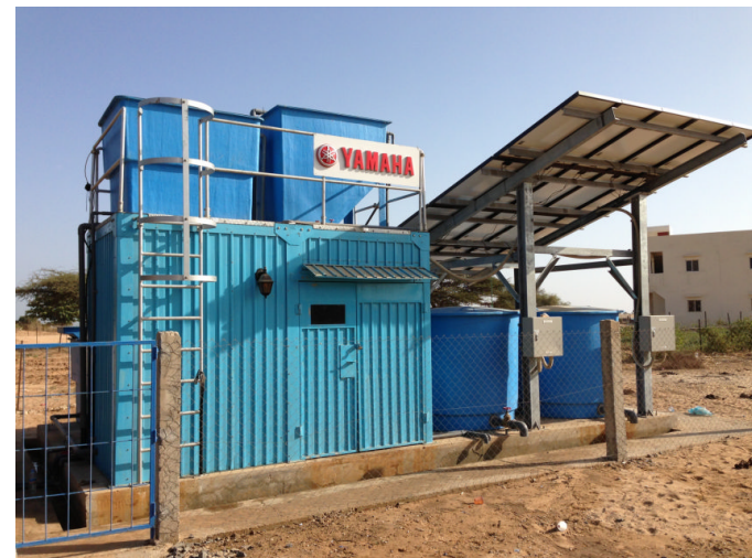
System with solar power