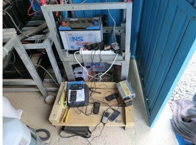
Charging mobile phones with solar power