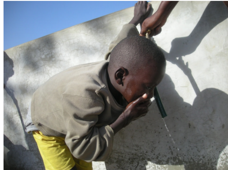
Clean water is available for villagers