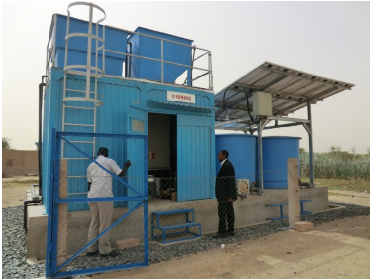
System (solar power option)