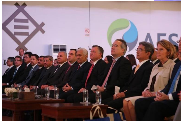
(HM King Abdullah II inauguration of IPP4)