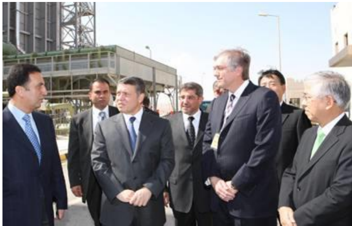
(HM King Abdullah II inauguration of AEPP)