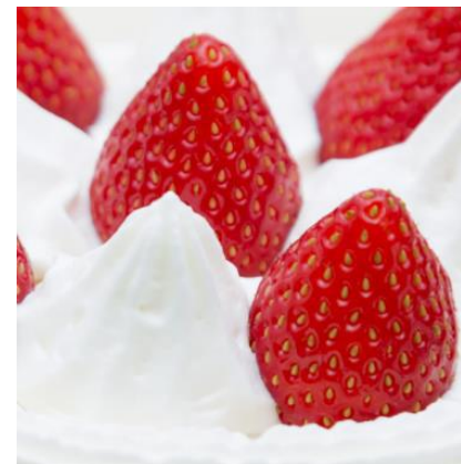
For shortcake use