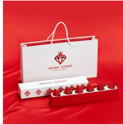
Platinum (6 pcs.)