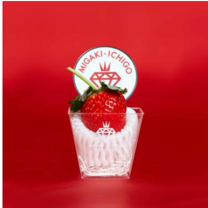
Platinum (1 pc.)