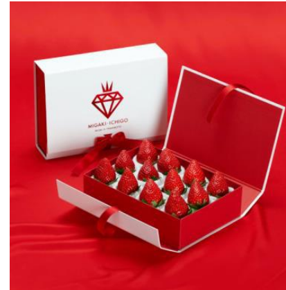
Platinum (12 pcs.)