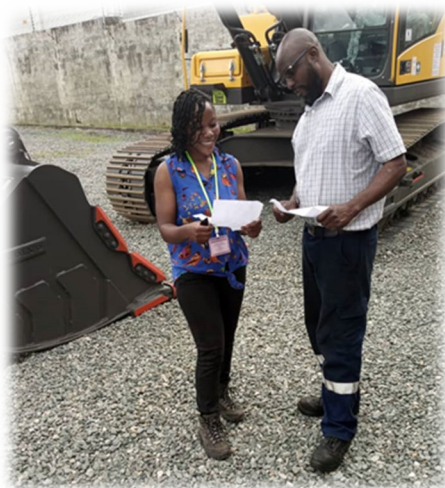
Surveyor conducting Labor Market Survey