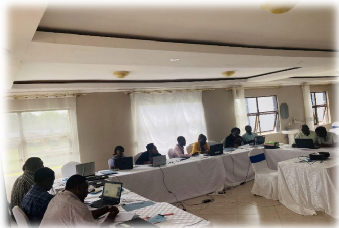
Monitoring and Evaluation Training for KVTC Staff