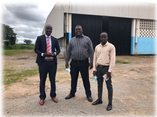
Knowledge sharing session with KVTC principal and Heavy Duty Operators College of Zambia