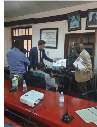
Komatsu WorksiteVR Simulator demonstration on October 12