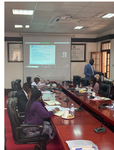
The PSC meeting took place on October 26 at MoWT