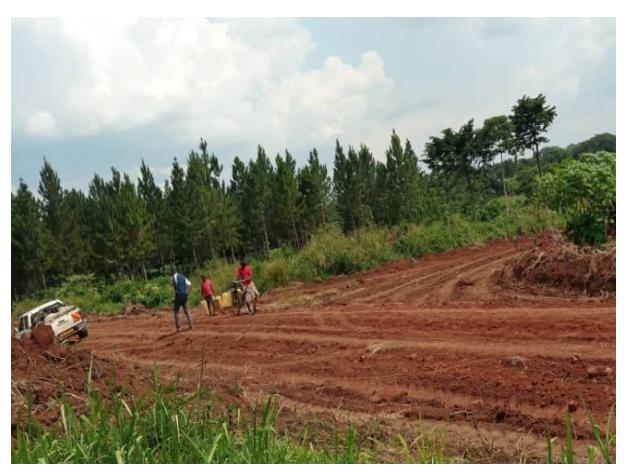
Roads from highway to the project site improved