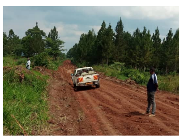
MoWT conducting due diligence at the project site