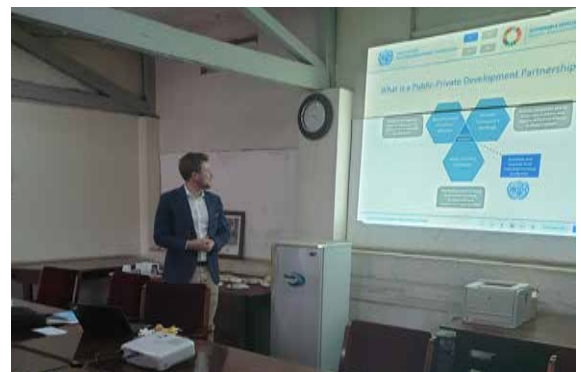
The 1st Technical Committee (TC) was held on April 28 at MoWT