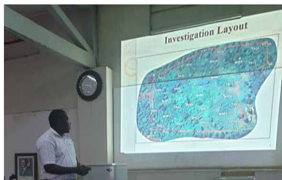
The contractor presented the geotechnical report to the TC