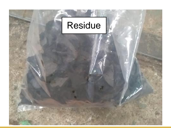
Shoes Soles Waste