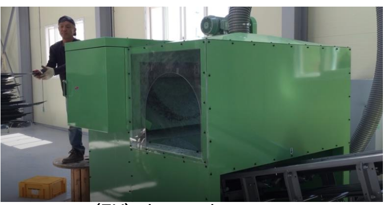
(EX) sheet glass