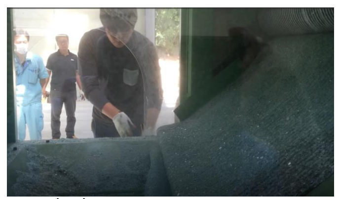
(EX) Laminated glass