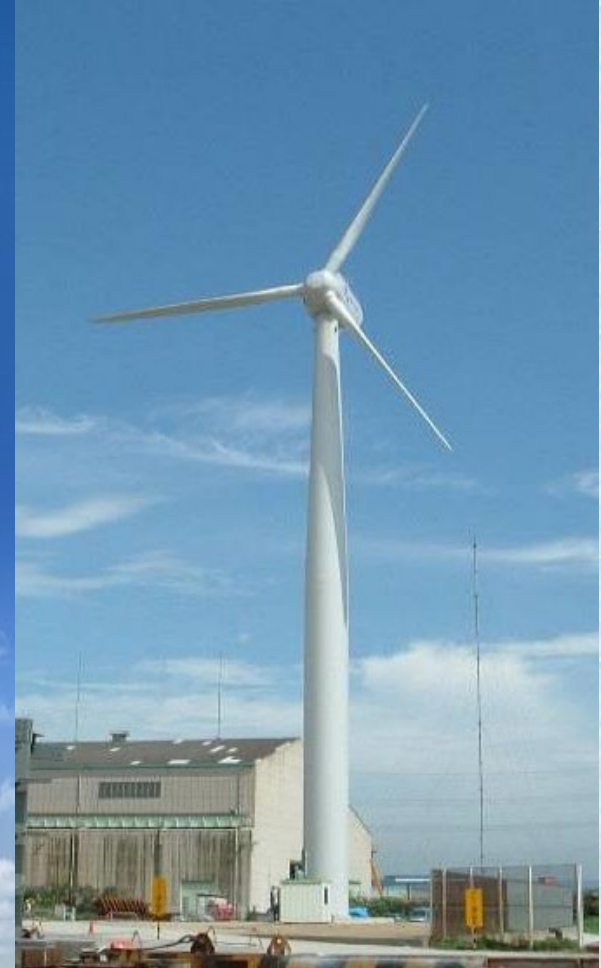
Wind Turbine and Sky Solar System