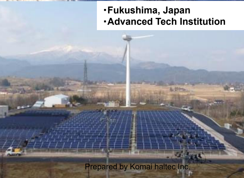
•Fukushima, Japan •Advanced Tech Institution