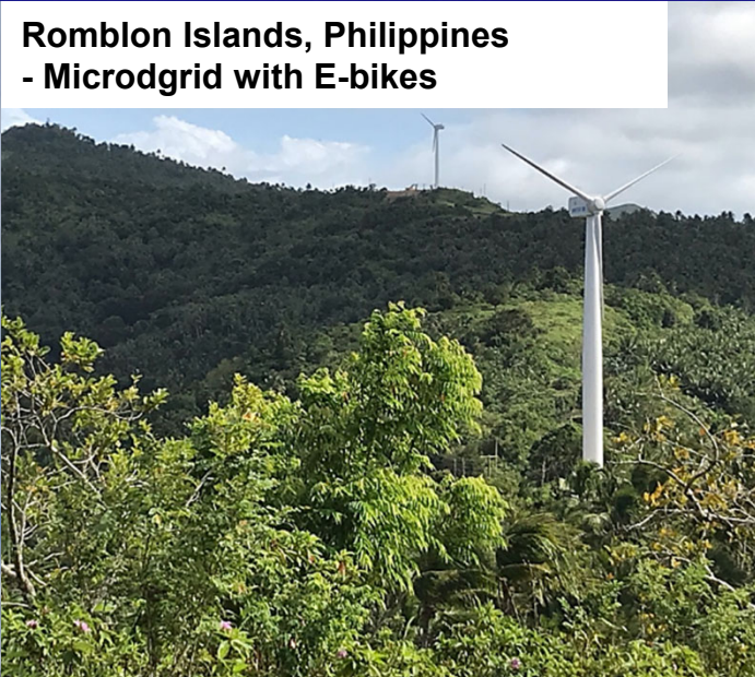
Romblon Islands, Philippines - Microgrid with E-bikes