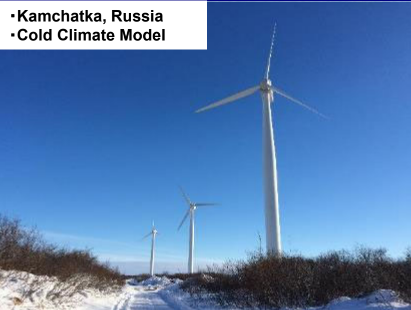
•Kamchatka, Russia •Cold Climate Model