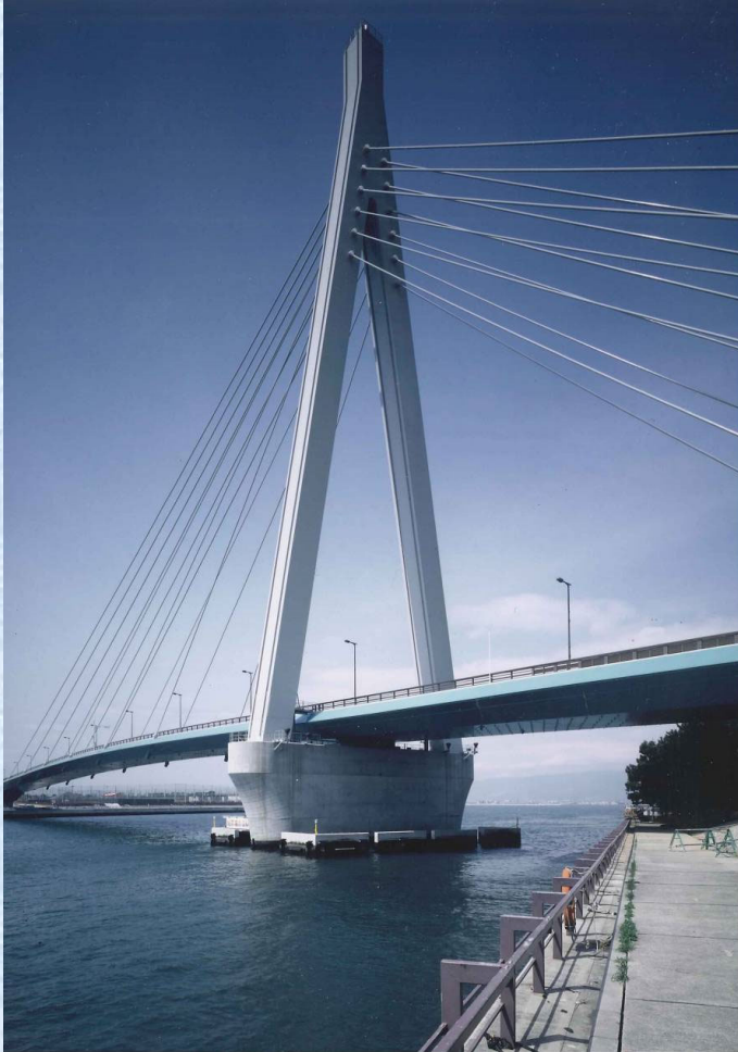
Steel Bridge Design, Fabrication and Installation