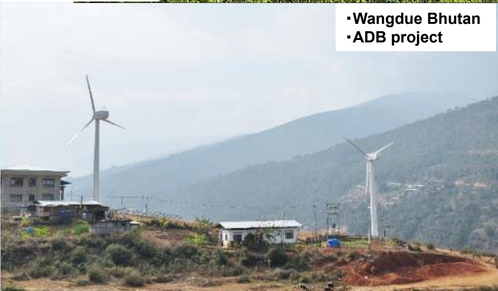
•Wangdue Bhutan •ADB project