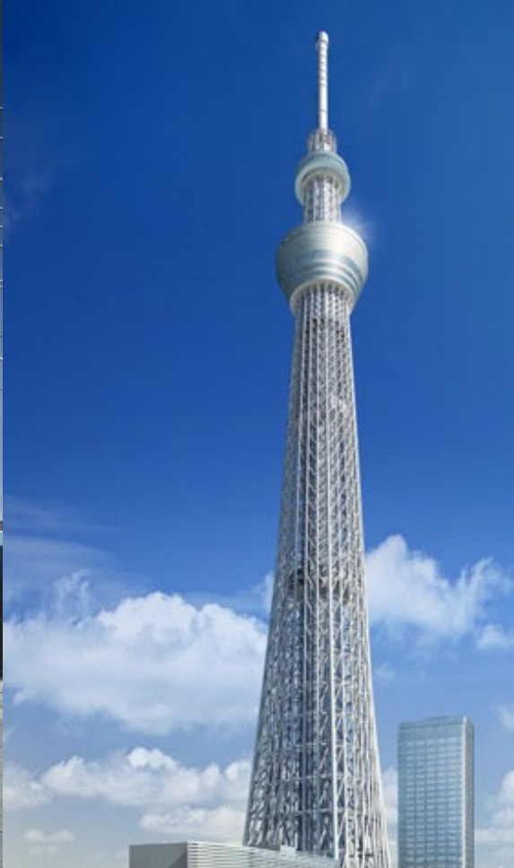
Steel Structure Fabrication