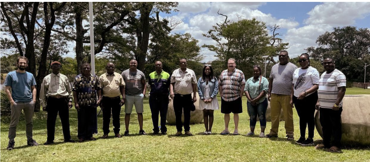
Group photo of team building participants