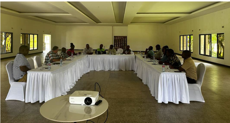
Photo of team building discussion