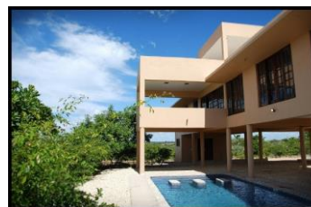
Tourism & Real Sate