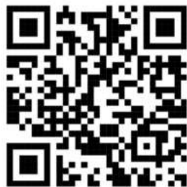
LAND BANK FROM MDAs