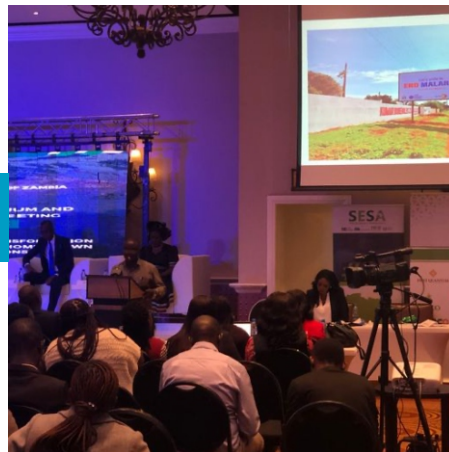
Photo taken during ZWES presentations