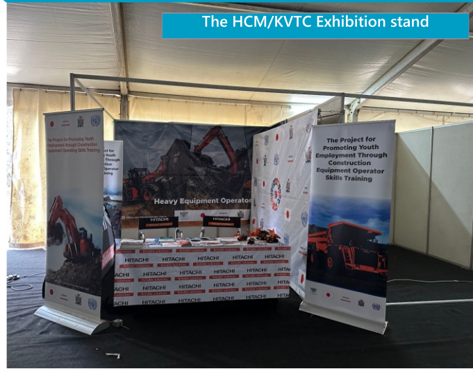
The HCM/KVTC Exhibition stand