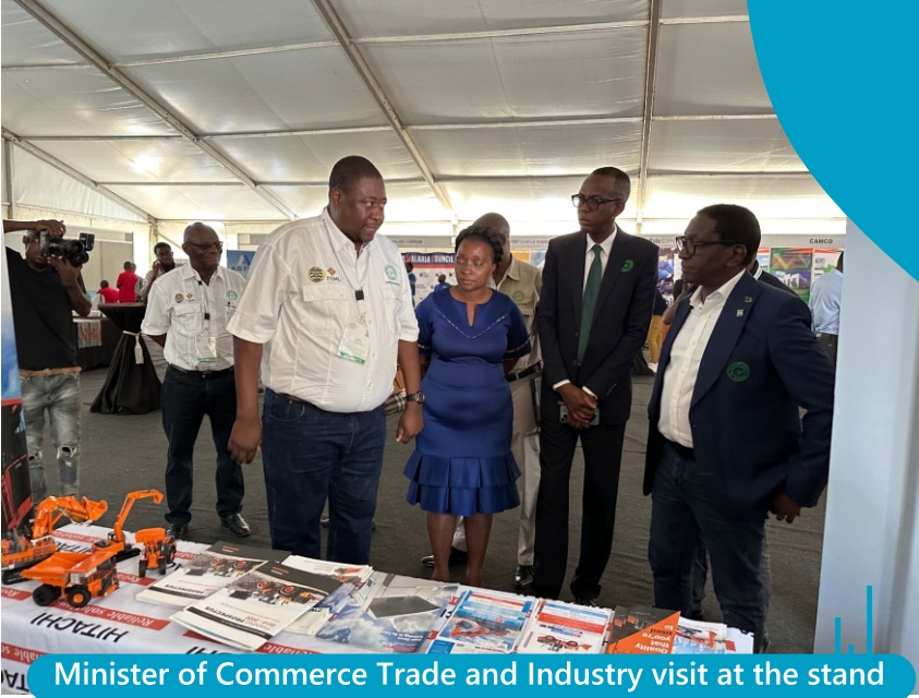
Minister of Commerce Trade and Industry visit at the stand