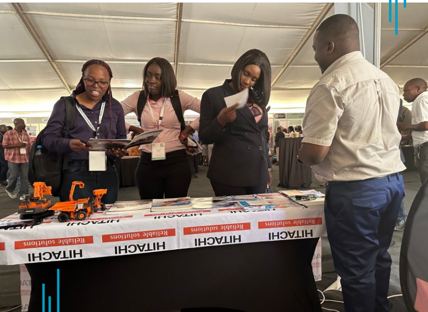
The Project Coordinator attends to guests on the stand