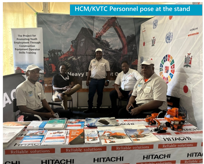
HCM/KVTC Personnel pose at the stand