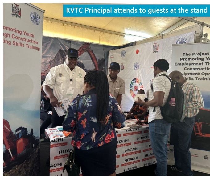
KVTC Principal attends to guests at the stand