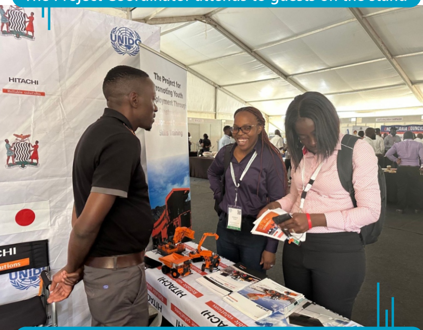
HCM Personnel attends to guests