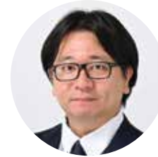
Professor Aoyama Business School