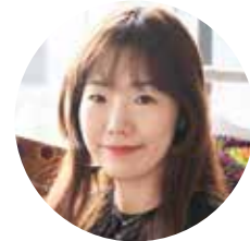
COO RICCI EVERYDAY