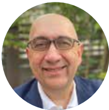
Deputy Head UNIDO ITPO Tokyo