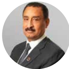
Head UNIDO ITPO Bahrain