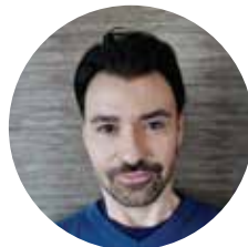
Co-Founder and CEO Mugen Links LLC