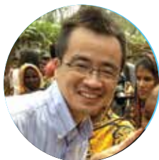
Director and CSO Impact Design Accounting Office, Inc.