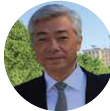
Professor The University of Tokyo