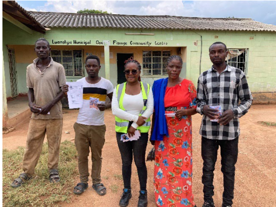
Project staff explaining HEO courses, distributing flyers and excavator operators' application forms to interested youths in Fisenge Community