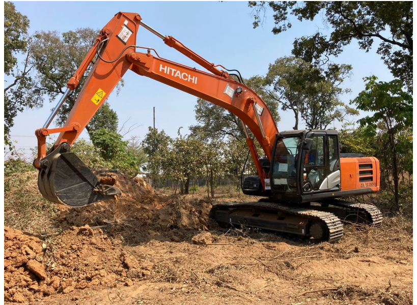
Scoping and dumping