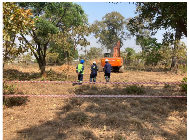
Trainers inside the designated practice area