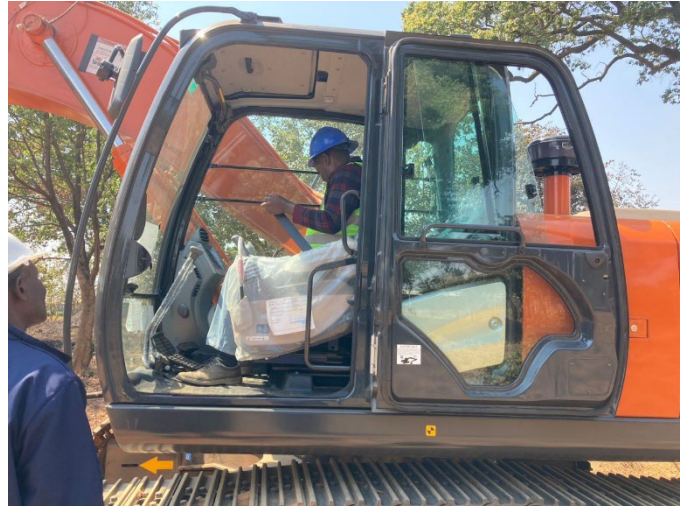
Cabin control orientation