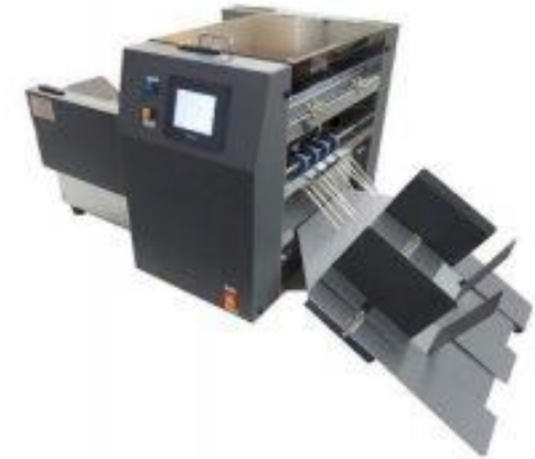
Direct soft package Printer