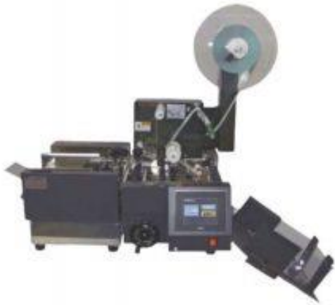
Direct soft package Label Printer

We are providing industrial direct printer and labeler, service, maintenance for manufacturing factory or supply-chain with Local distributors in the World