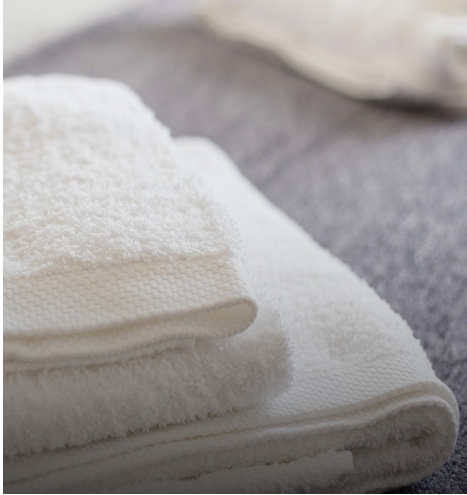
LUXURY BATH LINEN