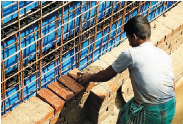
4 Bricks (outer formwork) pile construction