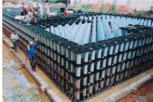
2 The SP main pipes are erected in the central part.