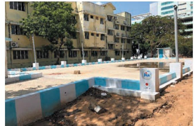
6 The upper area is ready to be used as a parking lot