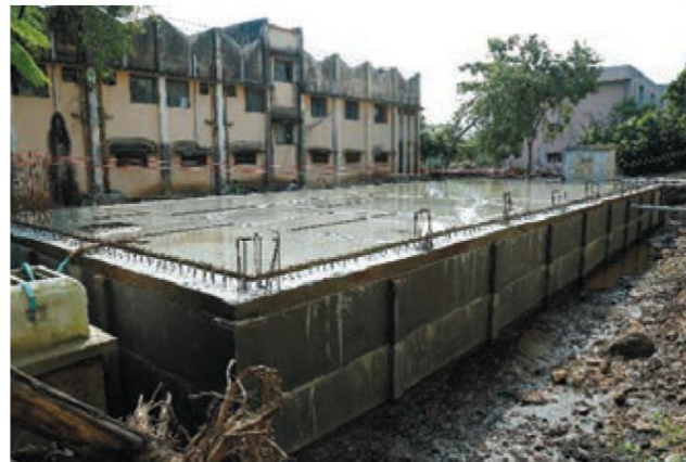
5 Completion of concrete placement