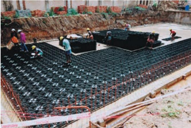
1 Start the installation of Aqua Palace partition plates