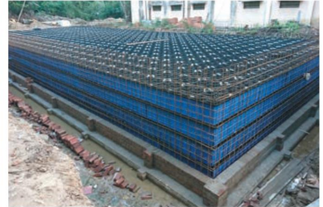
3 Install inner form plastic cardboards