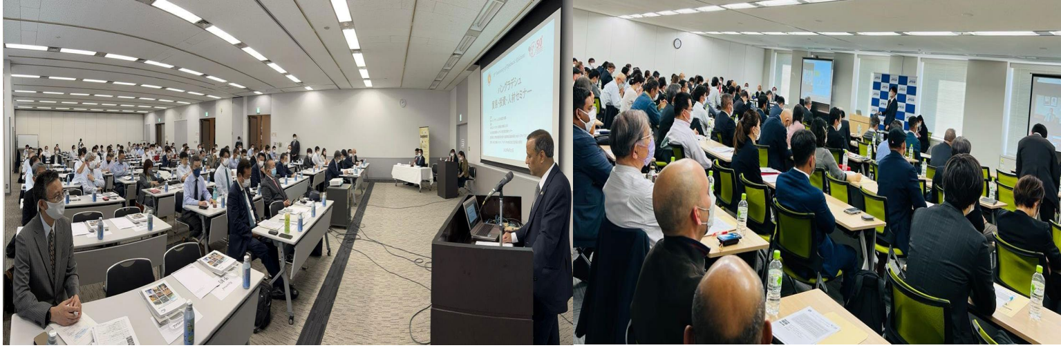
Trade, Investment & Human Resources Seminar, Saitama