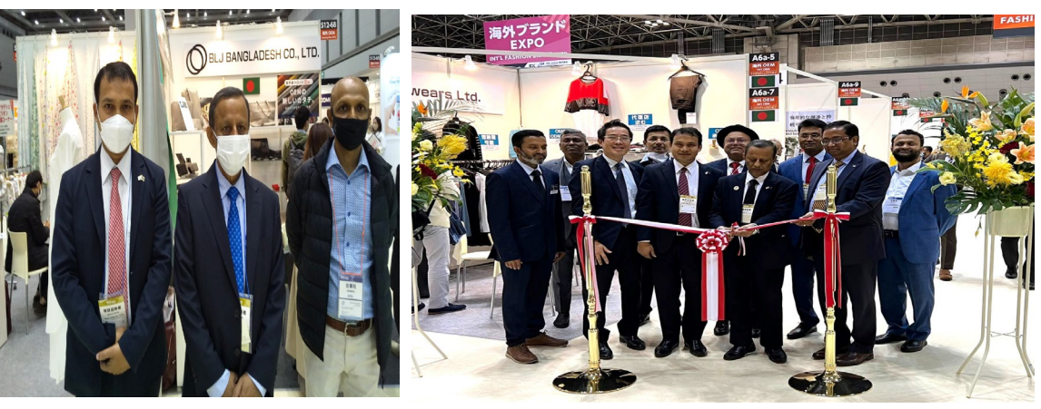
Fashion World Tokyo, Spring and Autumn 2022