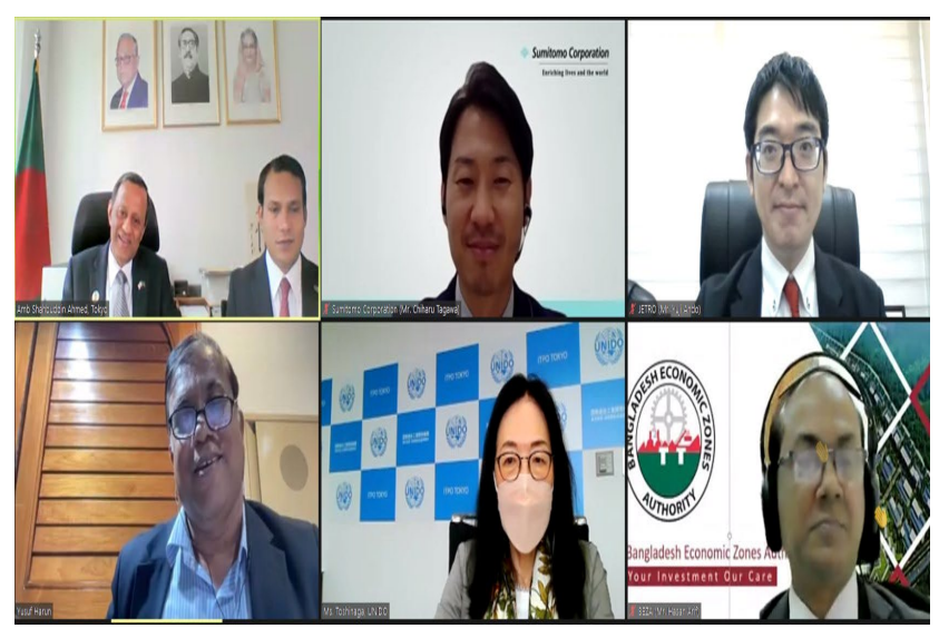
Webinar on Economic Zones in Bangladesh