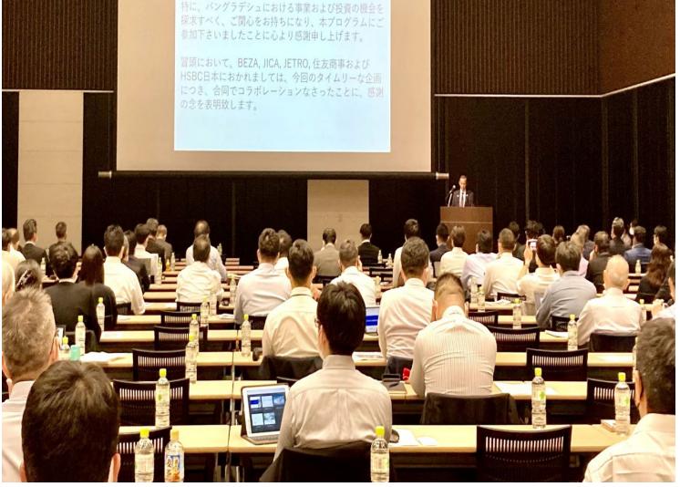
Investment Seminar, Tokyo