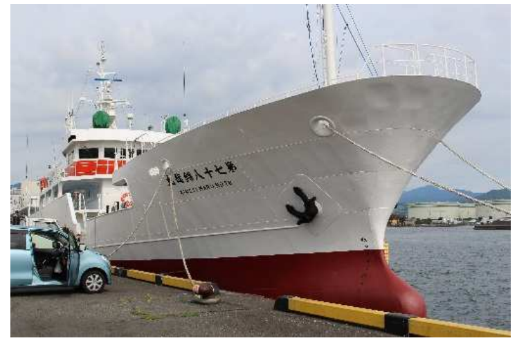
Deep-sea fishing Boat 400t

Yammer adopted our devices on their catalog