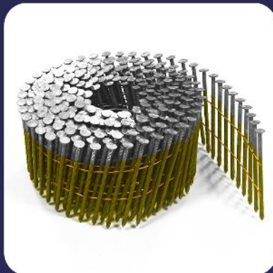
Wire Collated Nails