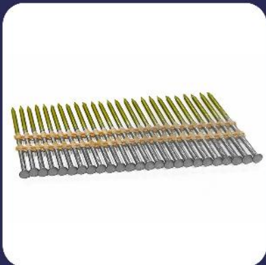
Plastic collated Nails