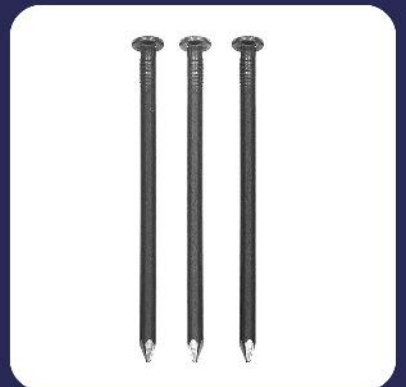
Hand Driven Nails

Corporate Office: Ghatala Towers, 2nd Floor, 19 Avenue Road, Nungambakkam, Chennai - 600034, Tamil Nadu, India.