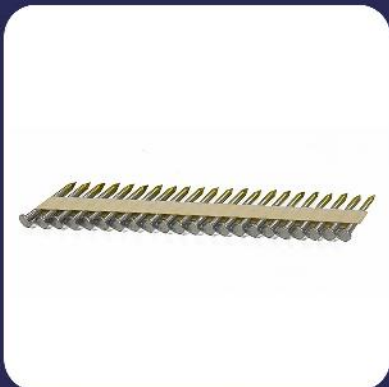
Paper Tape Straptite Nails