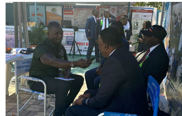
KVTC AND HCMZ TALK ABOUT THEIR PARTNERSHIP DURING THE RADIO INTERVIEW