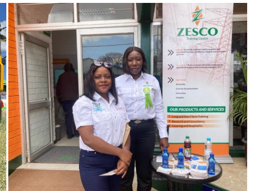
KVTC INTERACTS WITH THE VARIOUS COMPANIES EXHIBITING AT THE AGRICULTURAL AND COMMERCIAL SHOW