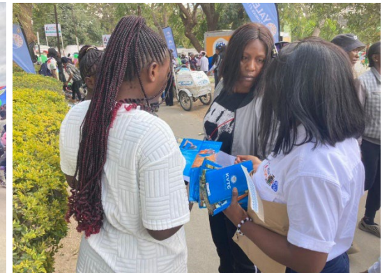
KVTC INTERACTS WITH THE GENERAL PUBLIC ATTENDING THE AGRICULTURAL AND COMMERCIAL SHOW