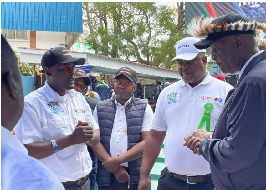
MINISTER OF TECHNOLOGY AND SCIENCE HON. FELIX MUTATTI VISIT KVTC STAND AND EXPRESSES HIS KEEN INTEREST TO BE INVITED TO THE LAUNCH OF THE HEO TRAINING COURSES