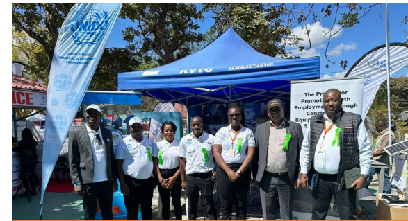
KVTC ALONGSIDE HCMZ POSE FOR A GROUP PHOTO AT THE OPENING OF THE 2023 AGRICULTURAL AND COMMERCIAL SHOW