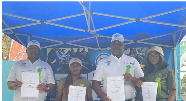
KVTC SIGN AN MOU WITH KAIZEN INSTITUTE OF ZAMBIA