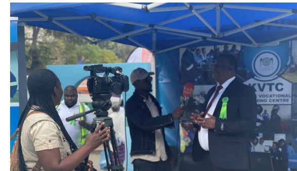
KVTC AND HCMZ CONDUCTING A TELEVISION INTERVIEW