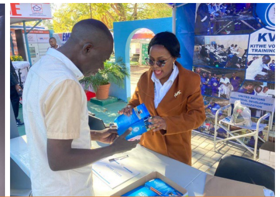
KVTC INTERACTS WITH INDIVIDUALS VISITING THE EXHIBITION STAND